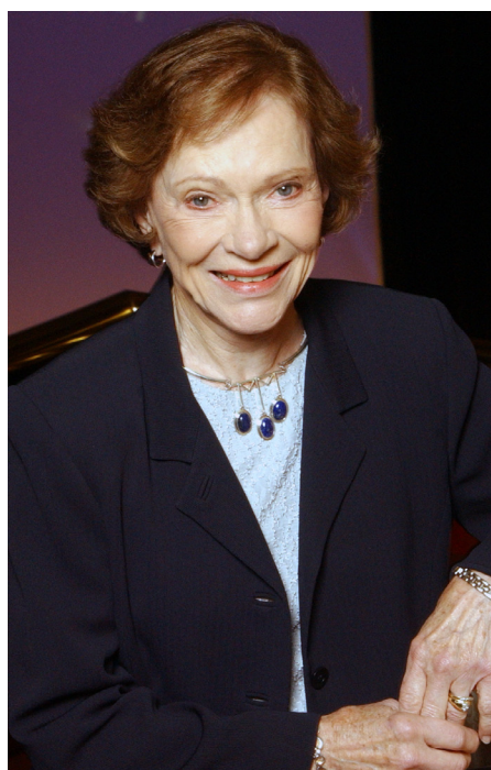
Former First Lady Rosalynn Carter has been a driving force in the field of mental health for more than 50 years and founded the Carter Center's Mental Health Program.

A nongovernmental organization, The Carter Center has helped to improve life for people in more than 80 countries by resolving conflicts, advancing human rights, preventing diseases, and improving mental health care.